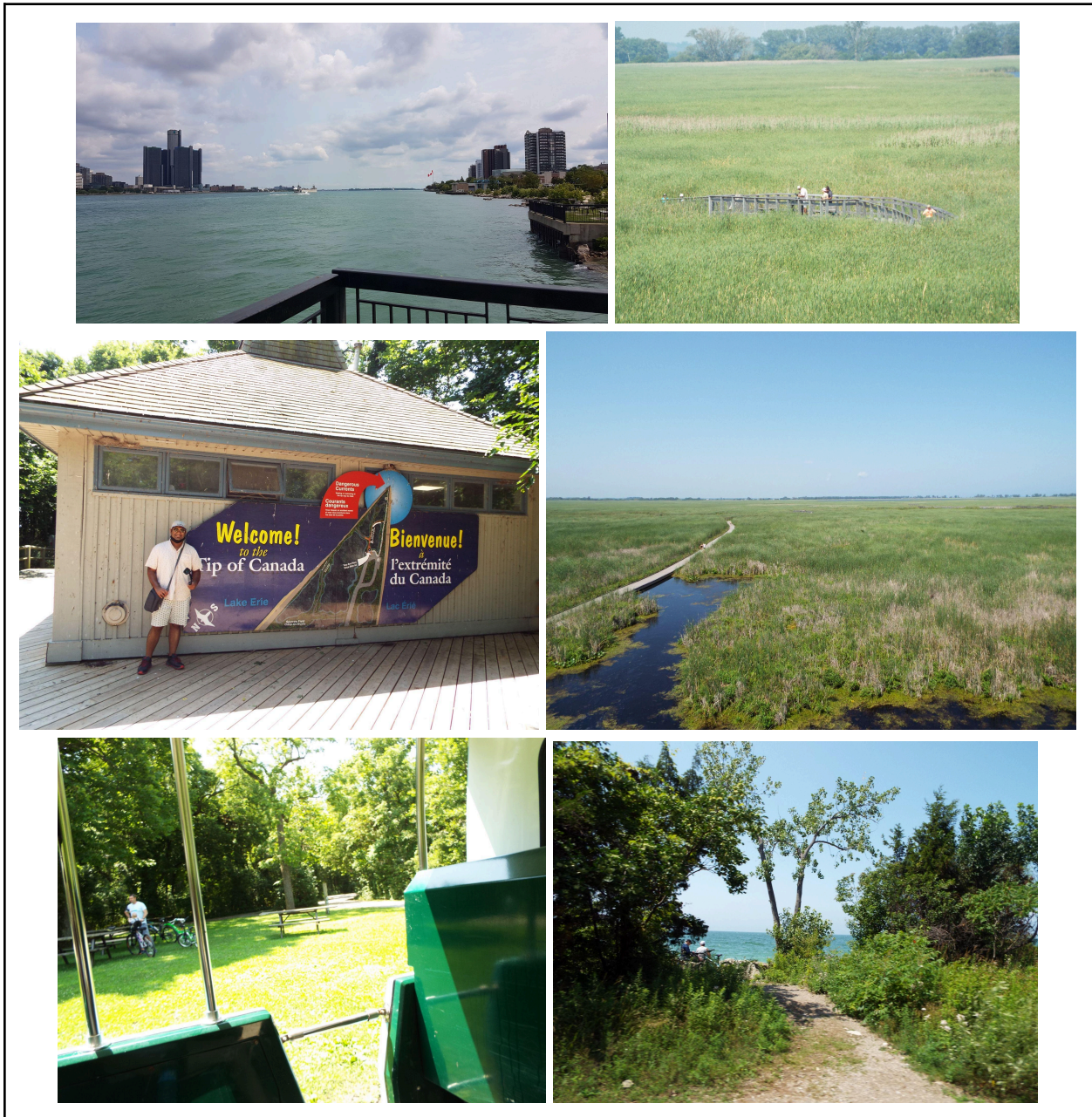
Detroit River, Boardwalk, Point Pelee National Park