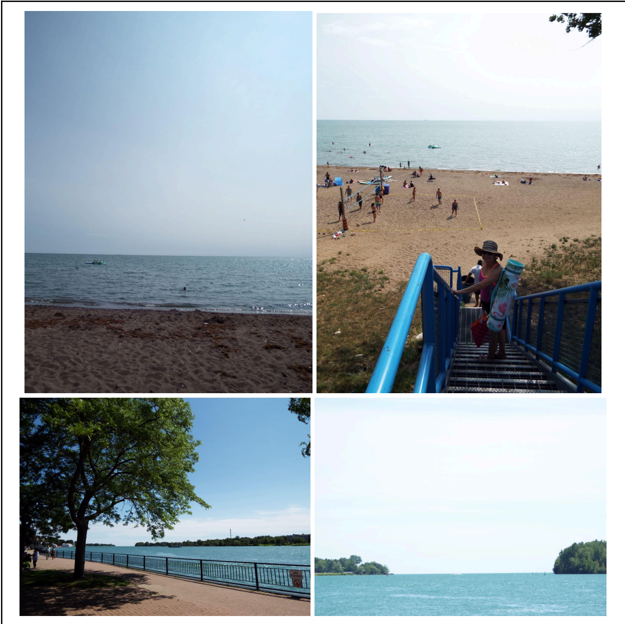
Colchester beach and Amherstburg waterfront